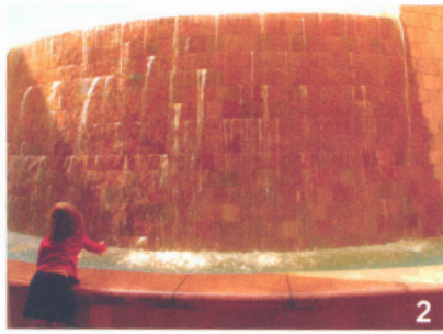
STUNNING LANDSCAPES ACCENTUATED WITH POOLS, FOUNTAINS AND NATURAL GROUNDWATER ADD CHARACTER TO COLORADO HOMES JULIE BIELENBERG REPORTS