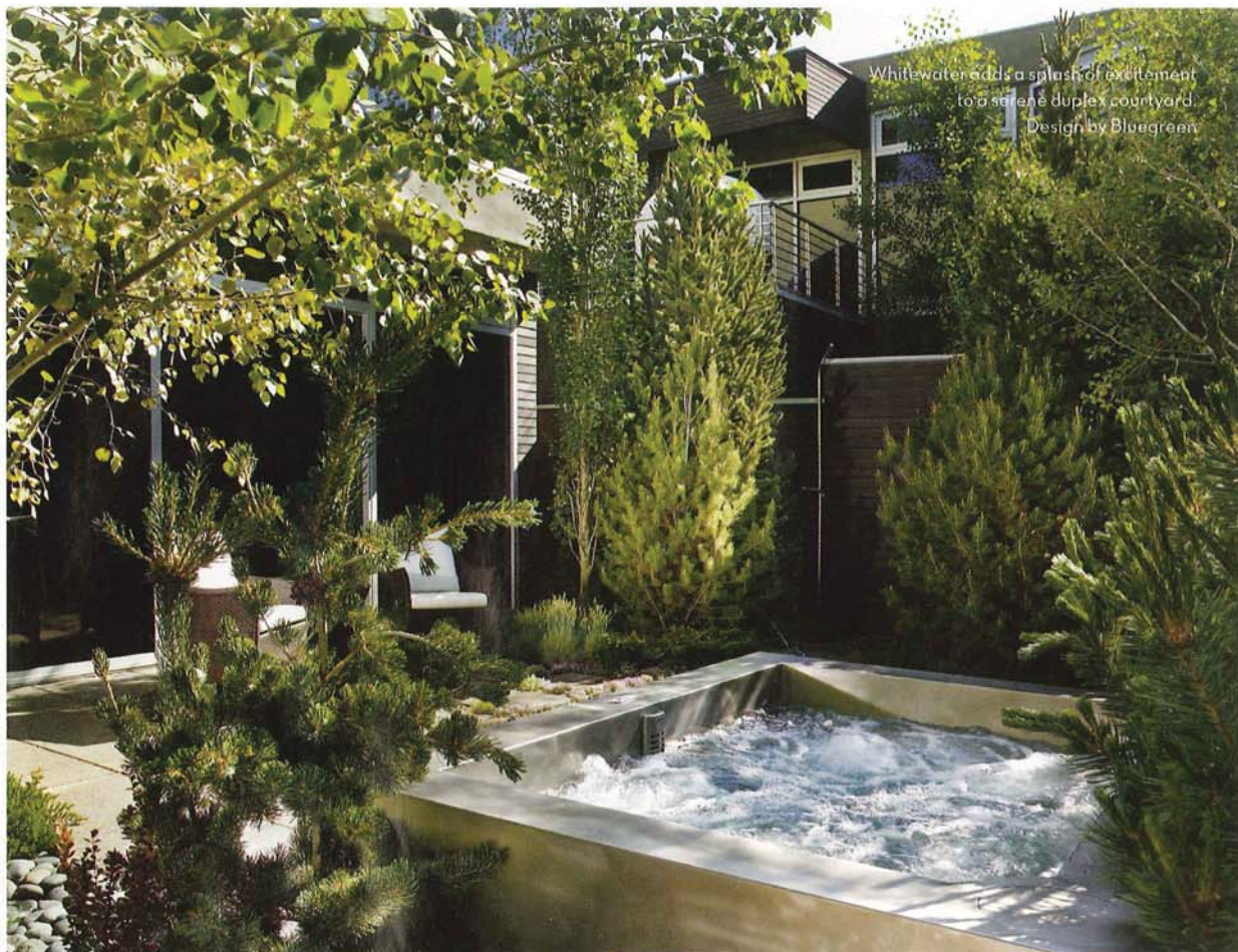
Whitewater adds a splash of excitement to a serene duplex courtyard. Design by Bluegreen