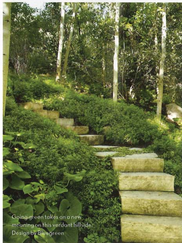
Going green takes on a new meaning on this verdant hillside.